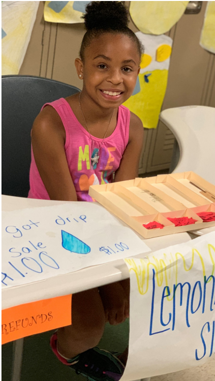
A Montgomery Education Foundation student raises money during Lemonade Wars.