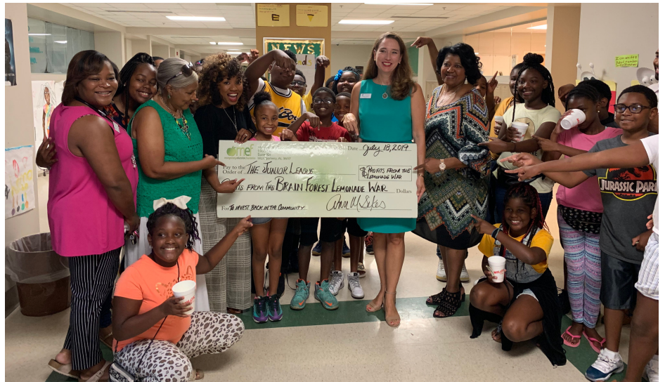
Montgomery Education Foundation students voted to give the funds raised from their Lemonade Wars back to JLM!

The ladies of the MEF Committee were dedicated to serving rising 4th, 5th and 6th graders, providing them skills such as business modeling, entrepreneurship, reading and problem solving.