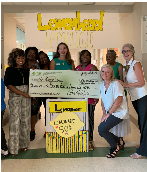
JLM members volunteer at the Montgomery Education Foundation Lemonade Wars.

The small classrooms offered the students opportunities to learn in nontraditional settings and gave volunteers the opportunity to assist the students with preparing merchandise for their pop-up shops, making slime, and making lemonade to sell during the "Lemonade Wars." The committee also worked the Weekly Incentive Store, giving students the opportunity to purchase items with the tickets they earned throughout the week for good behavior and participation.