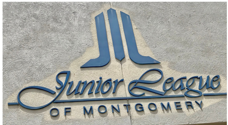
(Left) The Recruitment Team out in the community. (Above) Before & after exterior painting at headquarters.