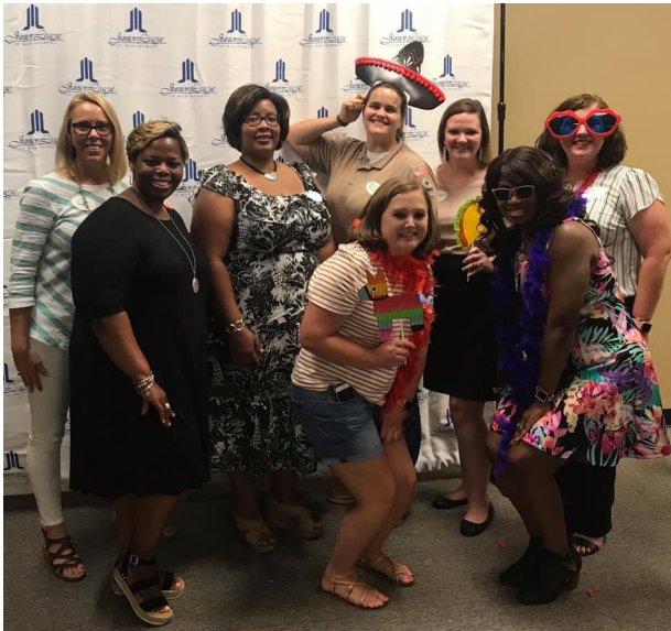
JLM Board & Provisional Mixer at headquarters in July. (Top and Right)